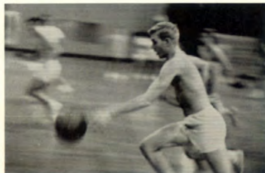
. . . down the courts