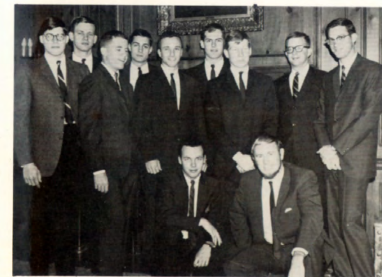
Undergraduate Secondary Schools Committee