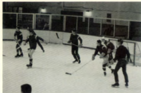
. . . down the ice