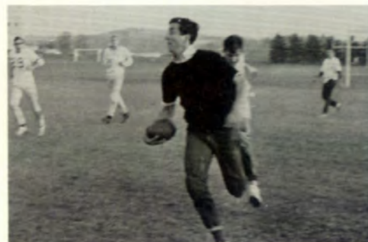
. . . down the field