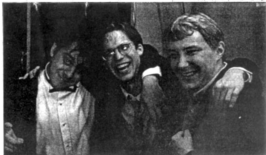
Alpha Delts enjoying Homecoming 1993.