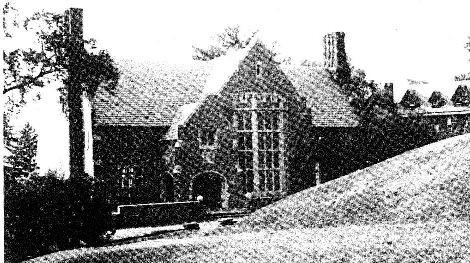
Home sweet home

Once again I would like to point out the motivation that the brotherhood has shown. One very evident example of this is the extra time individuals have spent on refinishing their rooms. The basement triple, once labeled the "pit", is a good case of renovation and change. Solid walls have been erected, the ceiling was redone, and all three rooms were repainted; all this work has been done by the brothers living there, (continued on page 6)