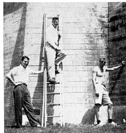
Three energetic brothers devote their time and effort patching up the cement on the Chapter Lodge.