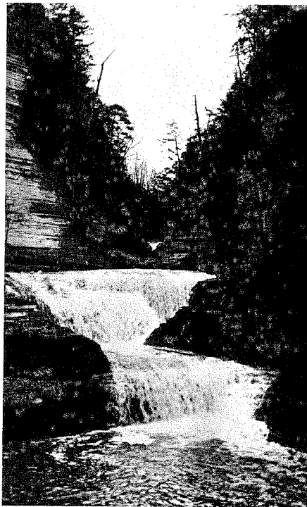
PICTURED ABOVE is upper Buttermilk Falls, one of the many scenic spots near Ithaca. Pinnacle Rock is discernible in the right background.