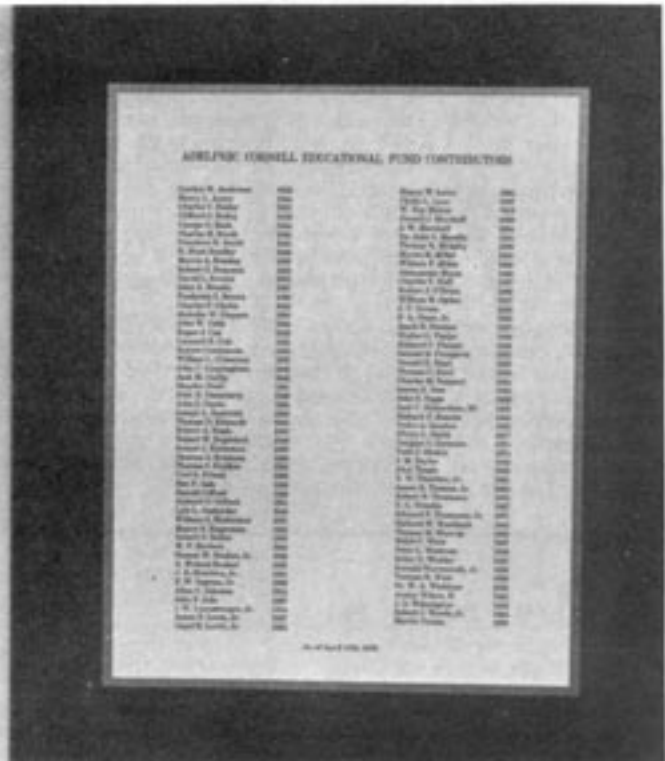
These two plaques continually remind us of our obligation to alumni and their continued support. The Adelpic Cornell Educational Fund, Inc. #16-6023220 is tax deductible.