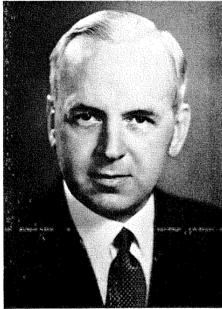
Cornell Alumni News