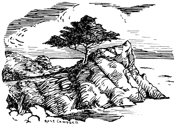
A pen and ink sketch of one of the beauty spots of Asilomar.